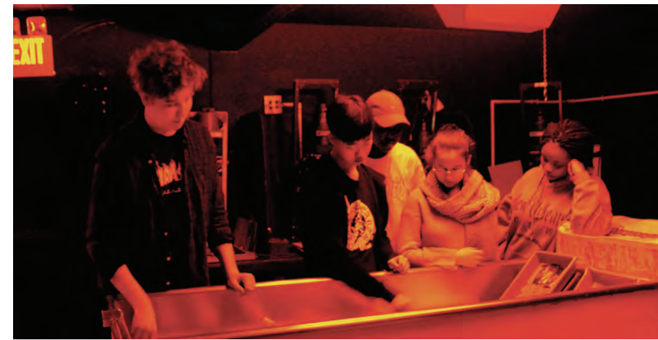
Students at work in the darkroom