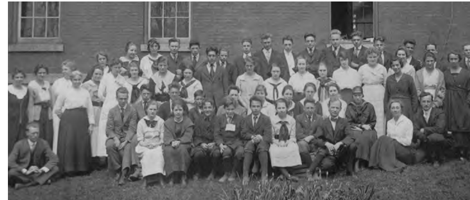
All School Photo 1916-1917

these fasces: Symbols of power, which have been handed down from one graduating class to another. Let me remove these ribbons, the red and white, and place here in their stead our class colors, the green and gold. May these relics serve as an inspiration to help you onward in your course. The future holds many opportunities for you, and we sincerely hope that you may profit by them; remember as the work is, so the reward shall be; also Oakwood's motto, "Palma non sine pulvere" - No reward without effort. ☑