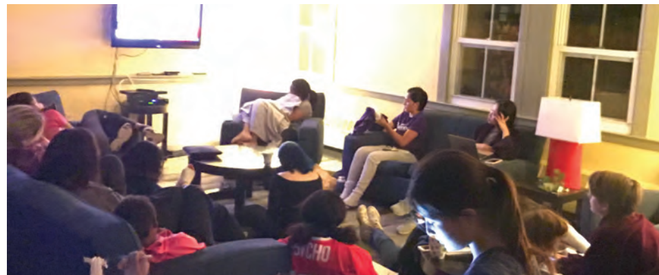
Watching the debate in Reagan Dorm in September

Working with these passionate students is more than inspiring – it gives me hope for the future. I look forward to working more closely with these and other students in the months ahead, seeing what issues they choose to explore, and celebrating the impact I'm sure they will have on the communities around them. ☑