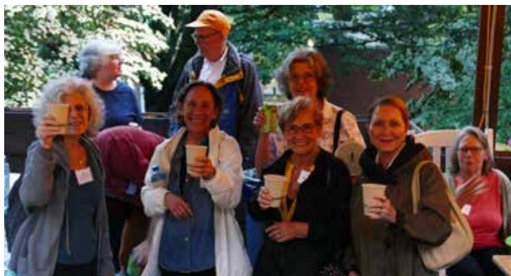
1973 Alums enjoying the patio fire-pit on Alumni Weekend