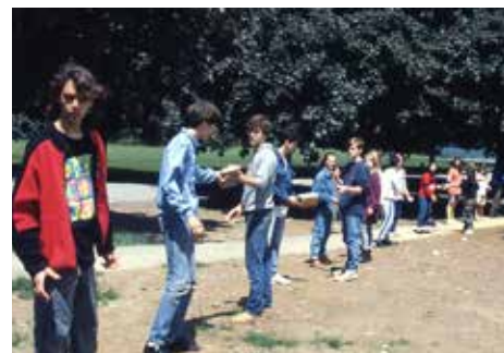
Moving the Library collection of books in 1990

The project began in response to recent book bans that have become seemingly more and more prevalent. The books on its shelves are an invitation to the school community, encouraging them to delve into these literary works and ponder why they have, or once had, faced bans. As the sign displayed above the new section states: "Words have power. Read a banned book." 📖