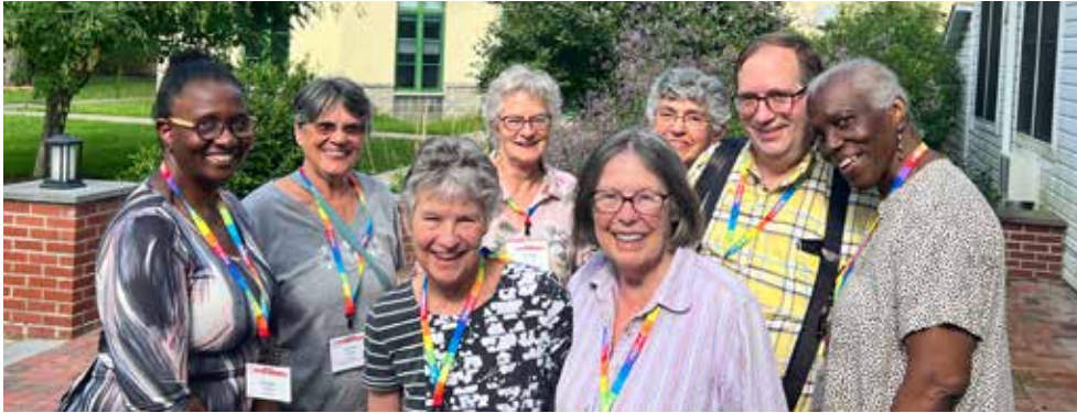
Members of NYYM at Summer Sessions at Oakwood

Our campus was bustling this summer with the arrival nearly 200 Quakers who attended New York Yearly Meeting's (NYYM) Summer Sessions, including three in-person guests from the Shinnecock Nation and an additional 100 registrants who joined online. Founded in 1694, New York Yearly Meeting is the gathering of Quaker meetings in New York State, northern New Jersey, and southwestern Connecticut. It was incredible to have such a presence on our campus and afforded us a wonderful opportunity to make connections and open our doors to the greater Quaker community!