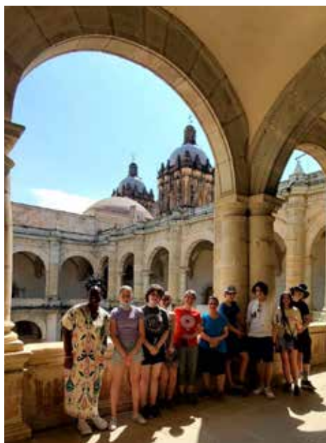
Spanish students at the Museo de Las Culturas de Oaxaca