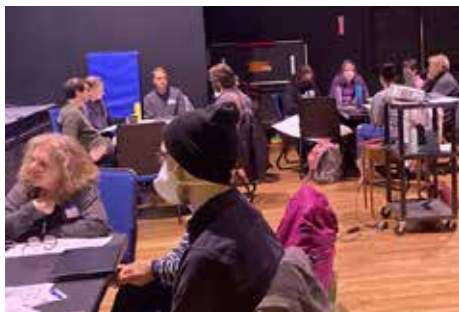
Faculty participating in the "Habits of Mind" workshop in January 2023