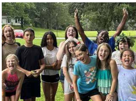
SAM campers having fun!

This year's Summer Adventure Makers (SAM) Camp led by Oakwood Middle School faculty with the help of Upper School students and recent grads offered rising 4th-8th graders the chance to participate in two weeks of fun, educational, scientific, artistic, hands-on sessions. Campers took part in activities such as Dungeons and Dragons, Stop Motion animation, Art, Performance & Storytelling, Oceanography, Brains & Brawn Scavenger Hunt, Week of Wizardry, Groovy Gardening, and DaVinci's Workshop. Many thanks for the hard work of faculty, students and alumni that went into making the program a success! 📌